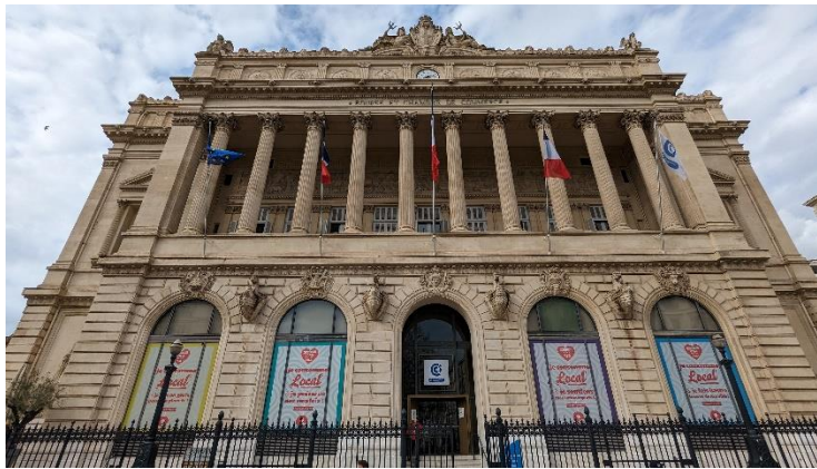
Palais de la Bourse

Chambre de commerce et d'Industrie Aix-Marseille-Provence 9 la Canebière - 13001 Marseille