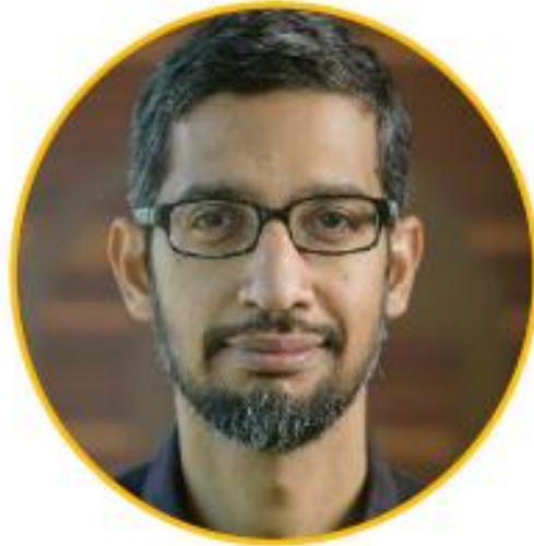
Sunder Pichai, CEO GOOGLE

« France has all assets to succeed. It has top engineers, great entrepreneurs, one of the best education systems in the world, great infrastructure, and successful global companies »